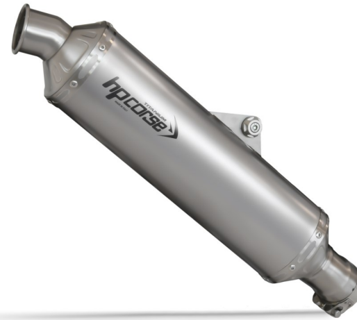
➤ OVAL SHAPED BODY 400 mm LONG