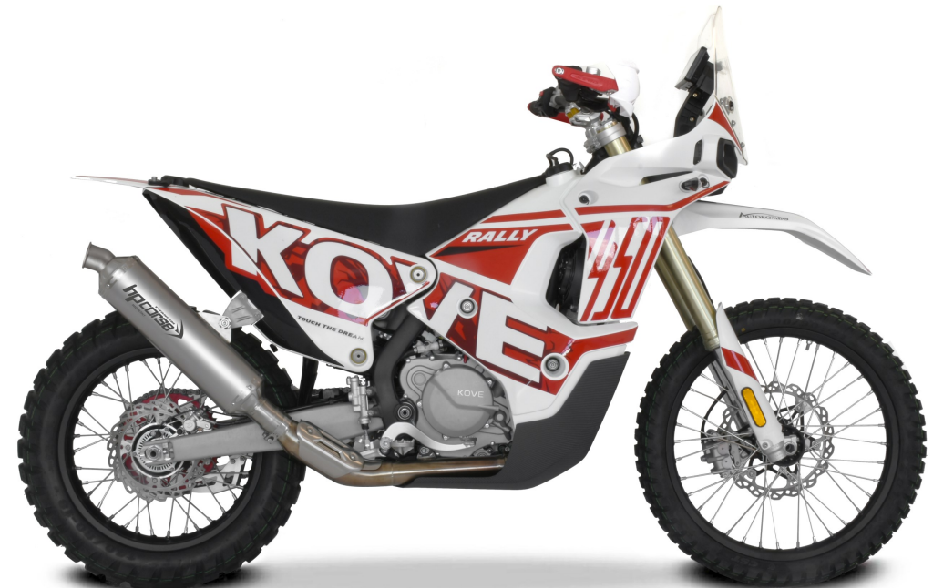
➤ STREET LEGAL APPROVED EURO 5