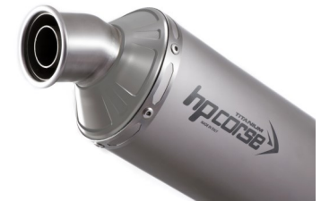
➤ EVOLUZIONE END-CAP DETAIL