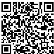
KOVE 450 RALLY